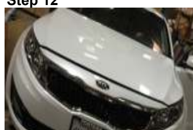
To install your new Anzo headlights reverse steps 11-2

AnzoUSA™ products are covered, by a limited one (1) year warranty, to be free of manufacturer's defects. However, certain AnzoUSA™ product categories have warranty policies which differ from this standard, please contact your representative for detailed category information. Damage due to improper installation or road hazards is not covered. Seller and manufacturers' only obligations shall be to replace the product proven to be defective. Neither seller nor manufacturer shall be liable for any injury, loss or damage, direct or consequential, arising out of the use of or the inability to use the product. Before using, user shall determine the suitability of the product for its intended use, and user assumes all risk and liability whatsoever in connection therewith.