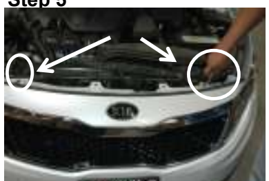
Remove (2) 10mm bolts located on each side of the bumber