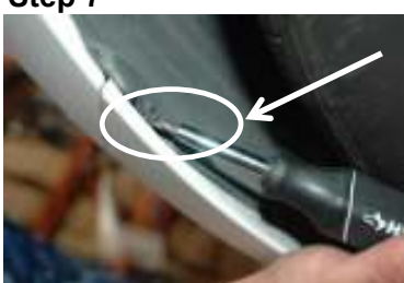
Remove (1) screw located on each side of the fender wall