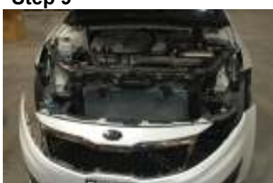
Before removing the bumber remove (1) 10mm bolt followed by push pins loacted underneath the bumber