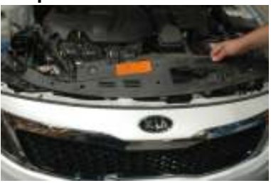
Before removing the plastic cover remove (2) 10mm bolts from the air intake