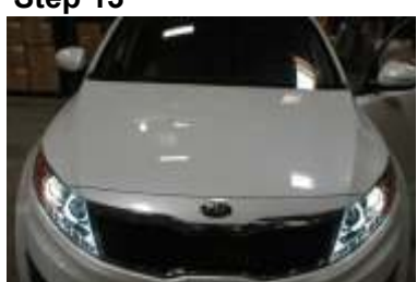
Test all functions before operating the vehicle